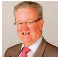
Stewart Stevenson Scottish National Party