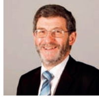
Convener Nigel Don Scottish National Party